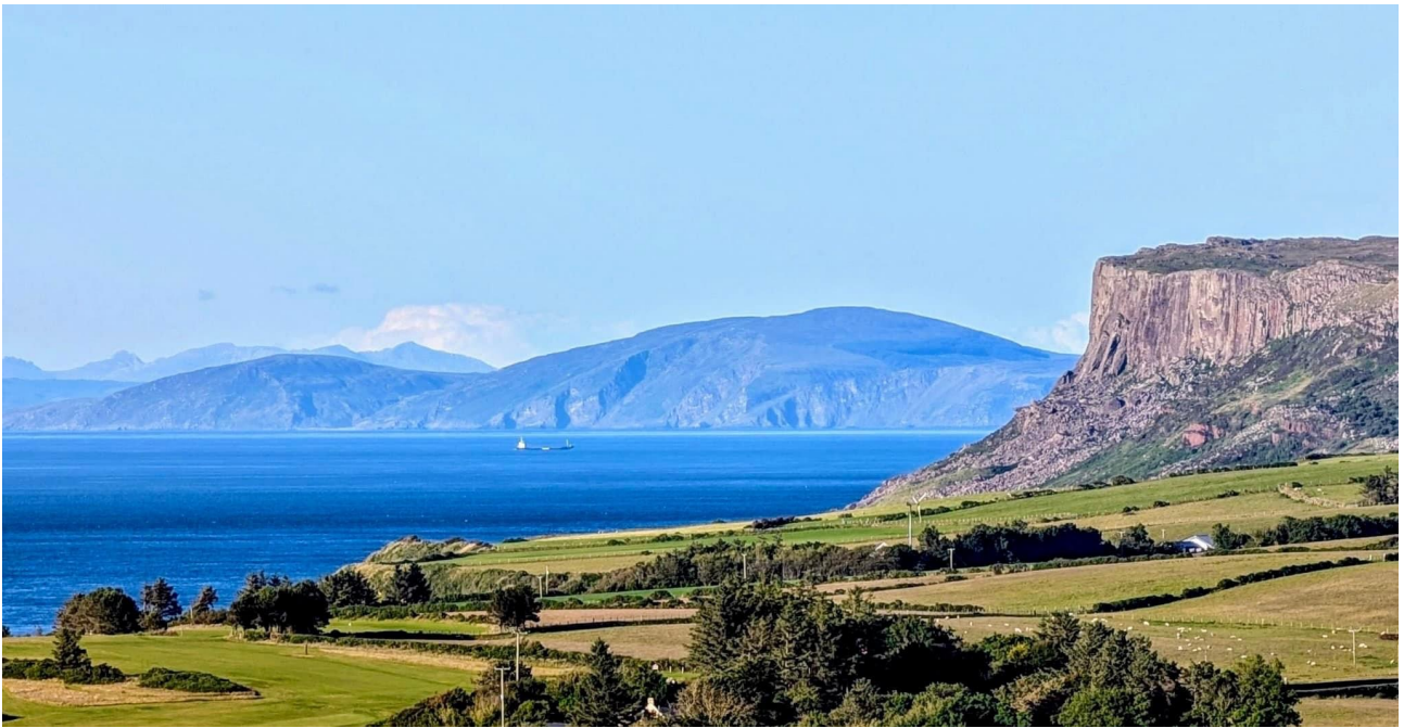
Fairhead, Ballycastle, County Antrim