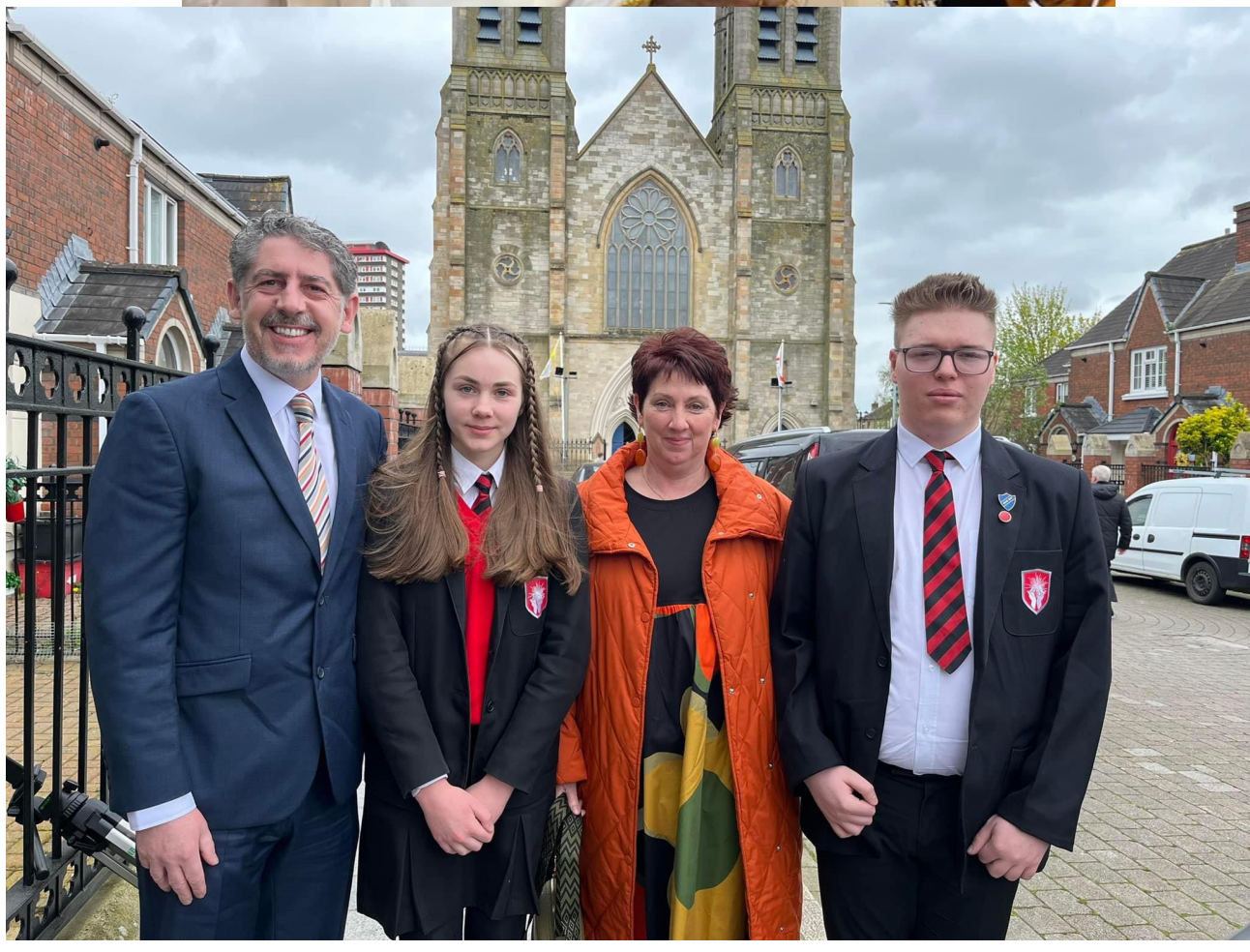
Bishop of Down & Connor. School and pastoral parish members from Ballymoney