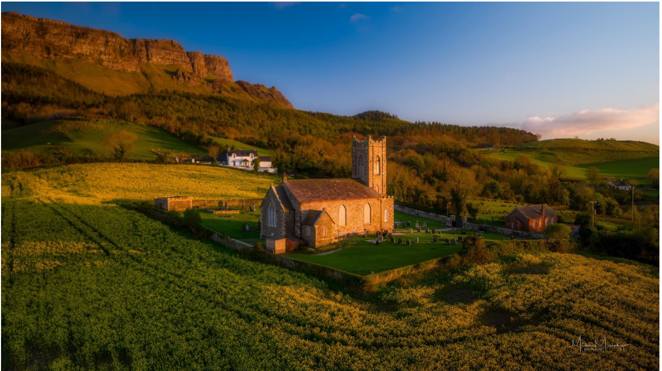
Image of the day Brighter Gold

Front page - Tamlaghtard Parish Church, Duncrun, Binevenagh..framed in gold - Brighter Gold - from the oilseed rape blossoms.