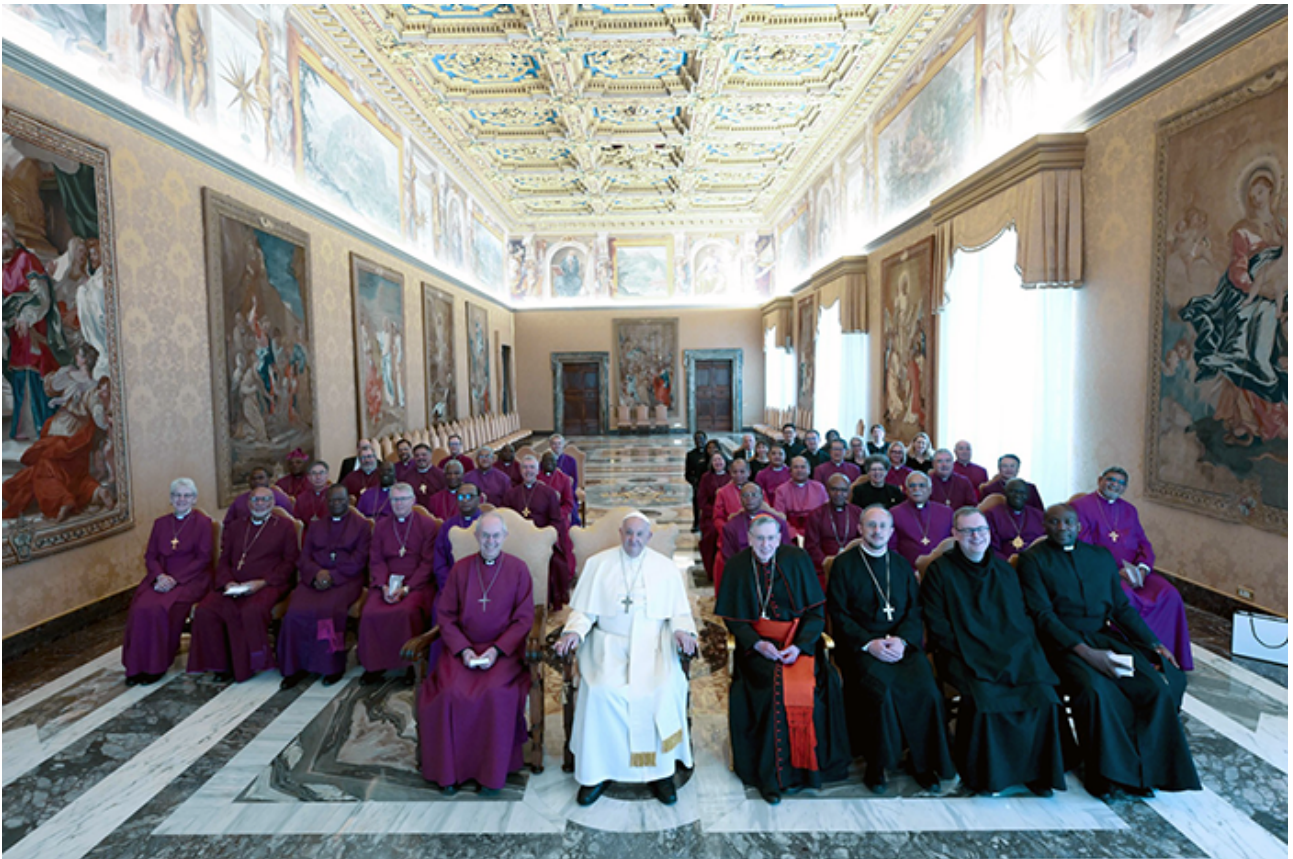
Abp Justin Welby, Archbishop of Canterbury and Pope Francis - In a historic meeting, Anglican Communion Primates from around the world attended an audience with Pope Francis at the Vatican, during the morning of May 2, 2024.

“Pope Francis was a great Pope — but above all, he was a faithful follower of Jesus Christ. ‘Blessed are the meek,’ said our Lord, ‘for they shall inherit the earth.’ In many ways, Pope Francis lived this truth. His humility and compassion touched hearts around the world. His example calls us all to care more deeply for the poor, the excluded, and the vulnerable. The world mourns his passing and gives thanks for his life. May he rest in peace and rise in glory.”