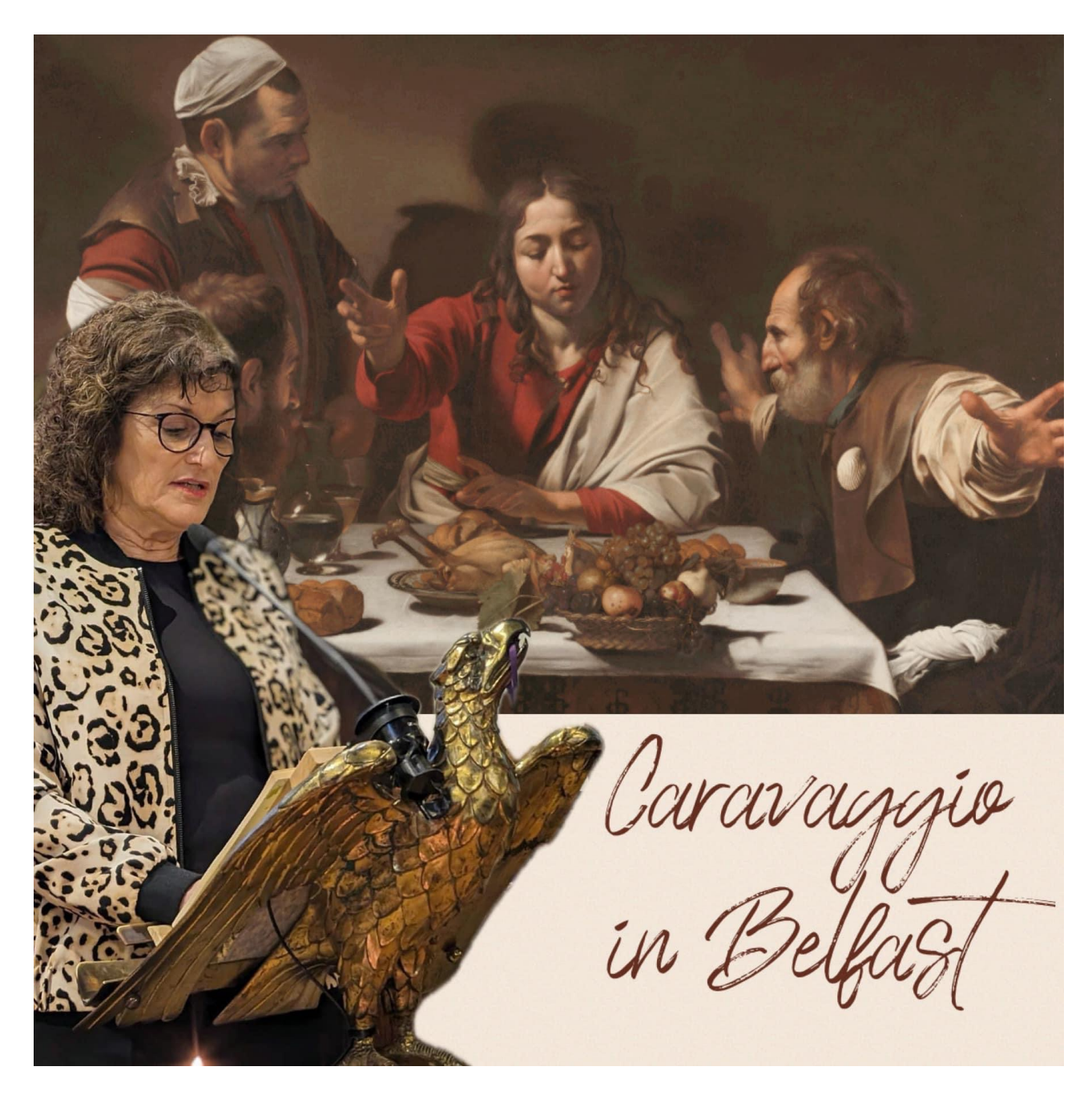
Caravaggio in Belfast talk