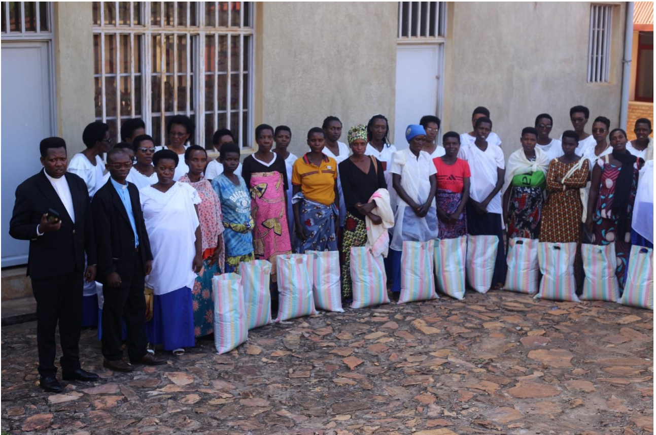
Image of the day - MU and CMSI aid for Burundi

MU Food distribution to vulnerable community members at St Luke's Cathedral Women's Day.