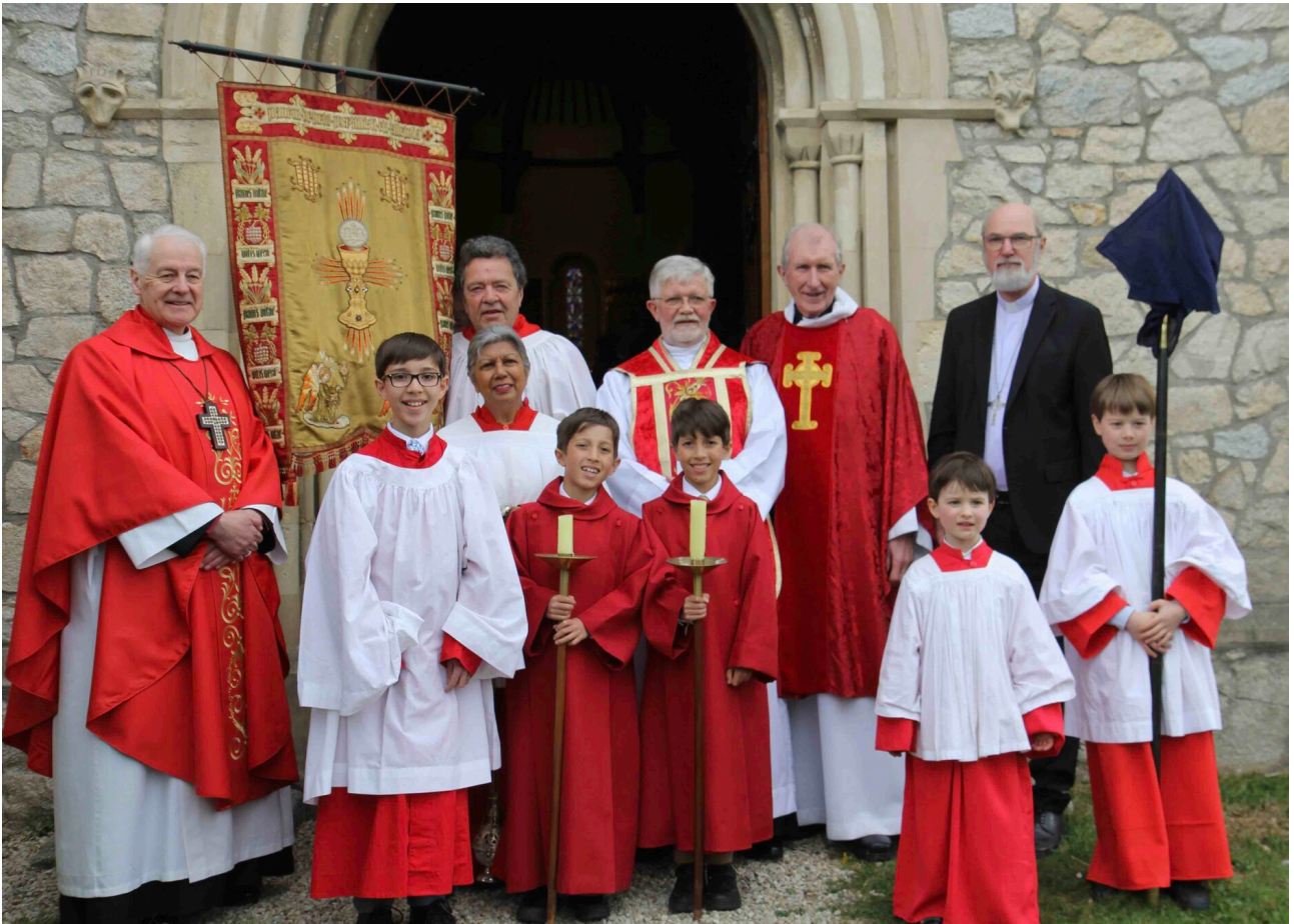
Image of the day – Palm Sunday Service marks 175th Anniversary of ‘Unique’ St John’s Sandymount