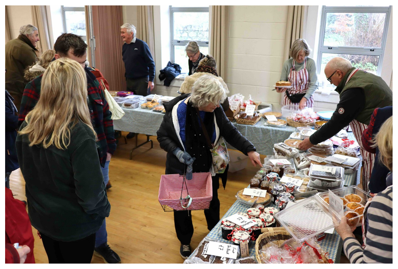
Rathmichael Food Sale for St Vincent De Paul in full swing.

The sweet options included fruit tea brack, almond tart, apple and blackberry crumble, rhubarb, cinnamon and orange crumble, Tunisian orange cake, chocolate cake, coffee cake, carrot cake, mince pies, Christmas Florentines and vanilla fudge. A selection of jams was also available.