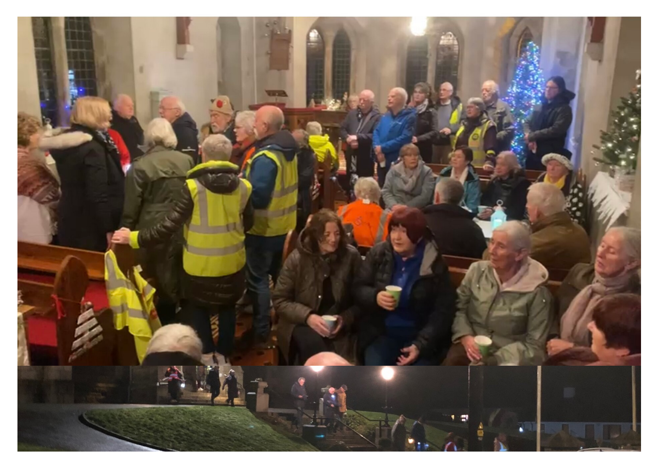
Leaving the Church of the Sacred Heart.