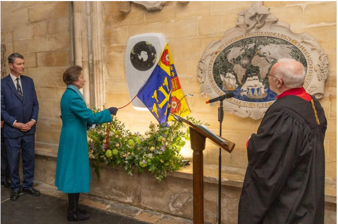
Image of the day – Irish tribute at new Shackleton memorial at Westminster Abbey