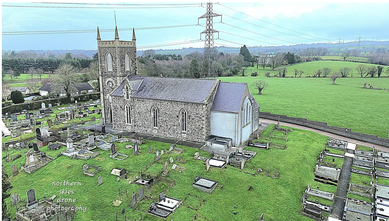
Magheragall Parish Church