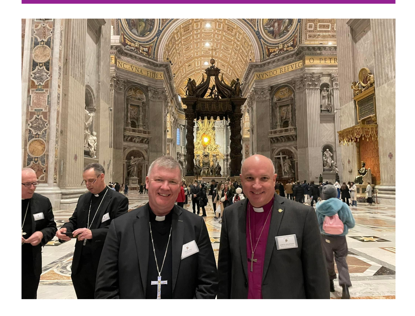
Image of the day – Irish bishops at Anglican and Catholic growing together event in Rome