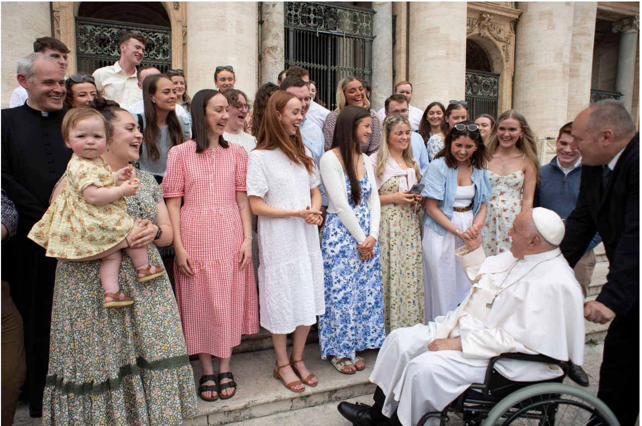
Image of the day – Queen's Chaplaincy Choir meet with Pope Francis