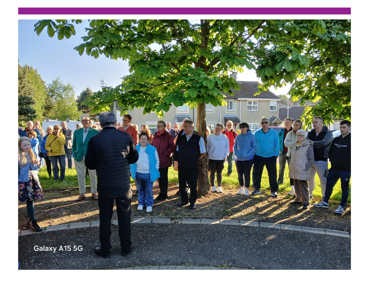
Image of the day – Contribution of Jewish refugees in County Down recalled