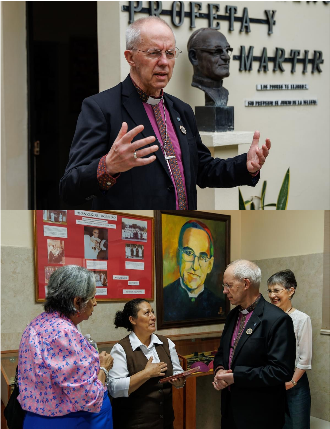
Archbishop of Canterbury and the Anglican delegation visit the chapel at Hospitalito La Divina Providencia in San Salvador where Saint Oscar Romero was murdered.