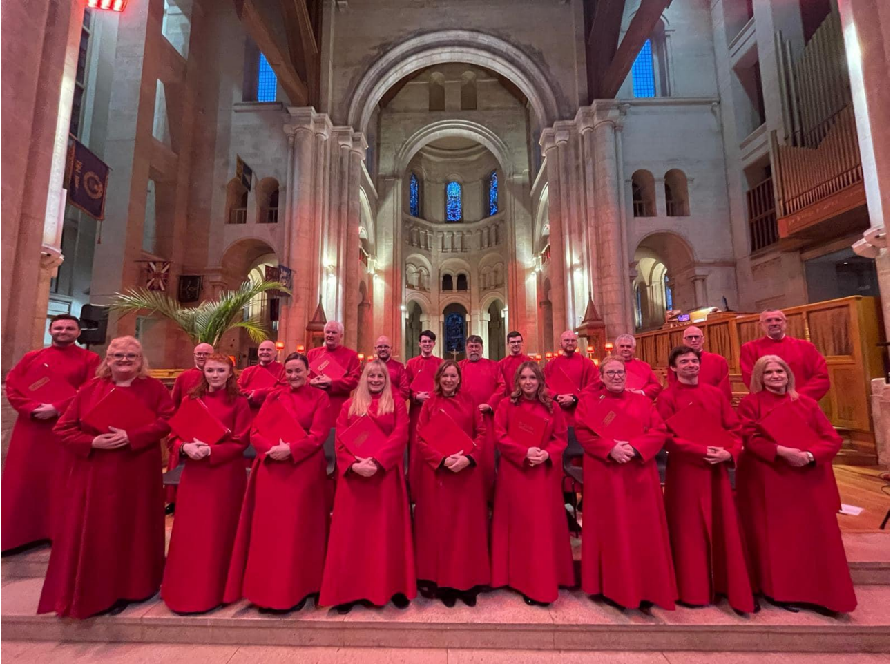
Image of the day – The Crucifixion by Stainer at Belfast Cathedral