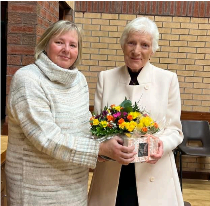
A presentation to the speaker at Eglantine