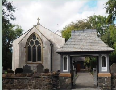
ST. CATHERINE'S PARISH CHURCH, KILLEAD, ALDERGROVE, CRUMLIN, COUNTY ANTRIM BT29 4EL