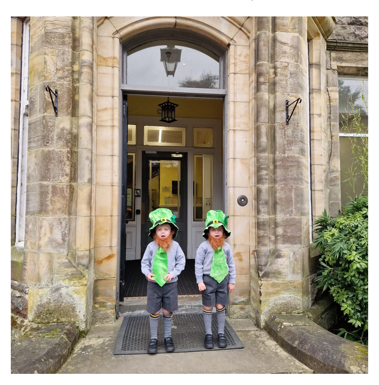
A St Patrick's appearance at Inchmarlo, prep department of RBAI

The programme has since been approved by the NI Assembly and officially published earlier this month. It sets out a plan to grow the economy, deliver affordable homes and early years childcare, cut health waiting times, end violence against women and girls, support SEND children, protect the environment, and transform public services.