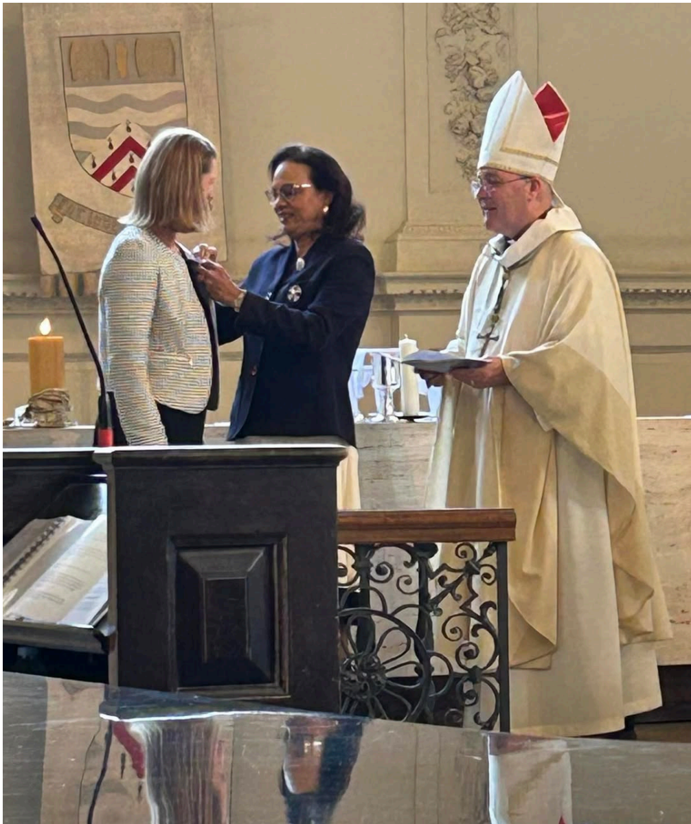
Image of the day – Mothers Union World Wide President commissioning