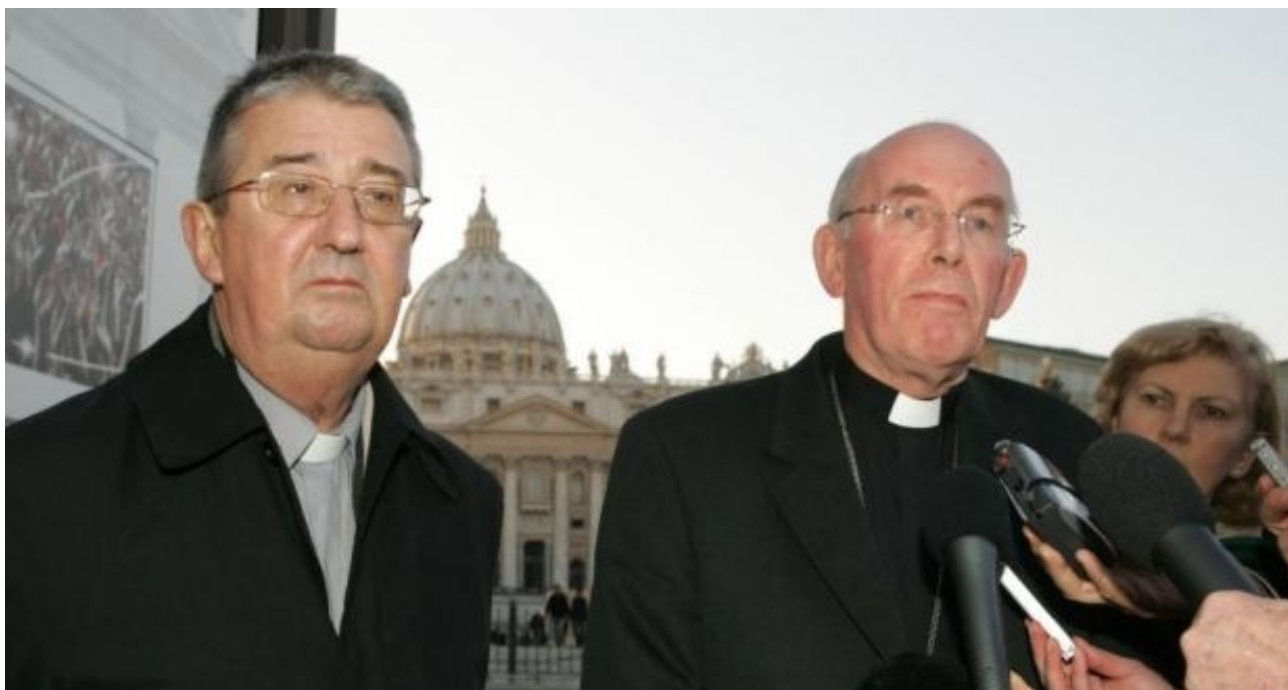
The Irish Catholic Bishops' Conference - of which Cardinal Seán Brady (right) is president and Archbishop Diarmuid Martin (left) is vice president - has called on first time voters to make their voices heard in the local and European elections.