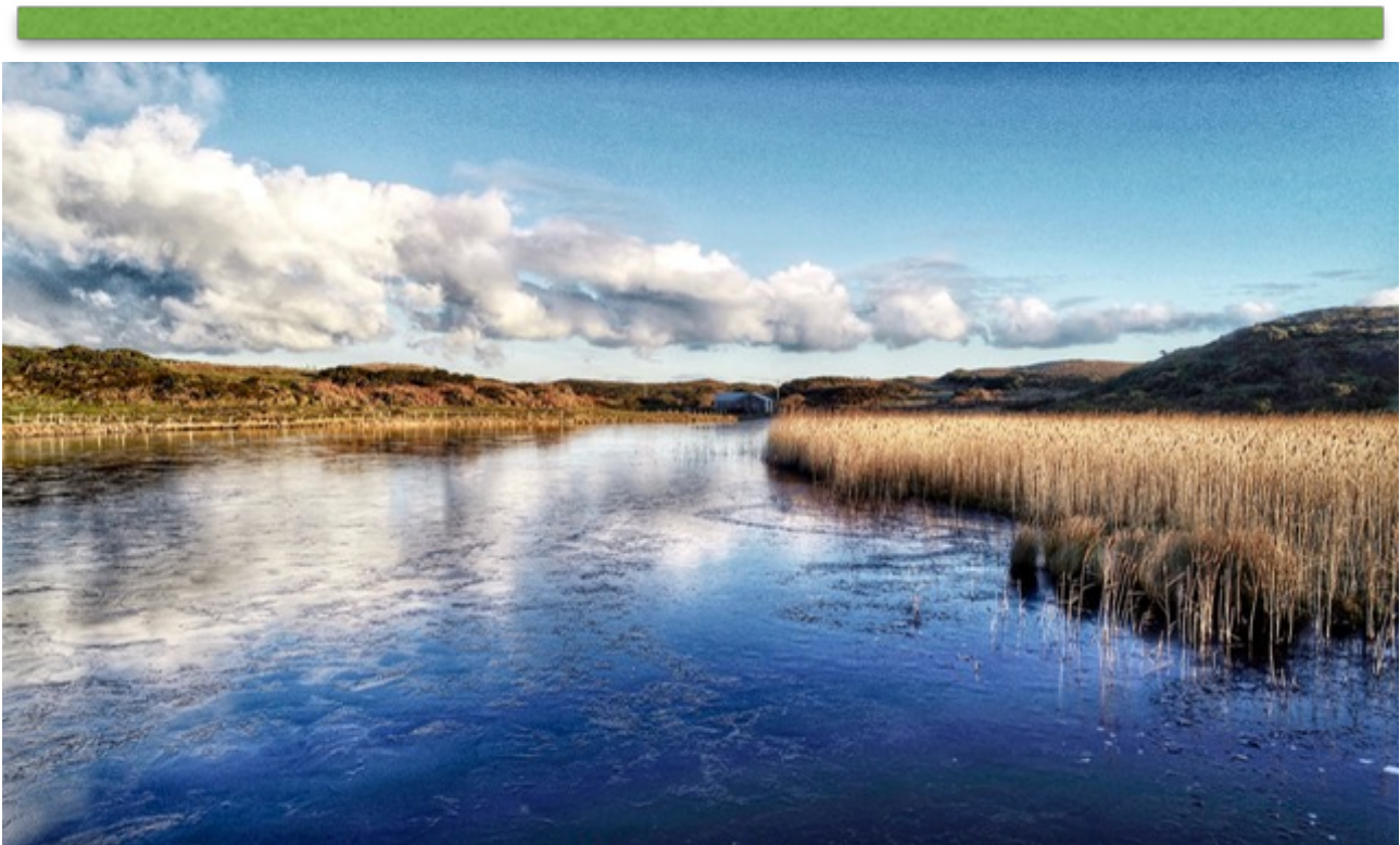
Image of the day -Craigmacagan Lough on Rathlin