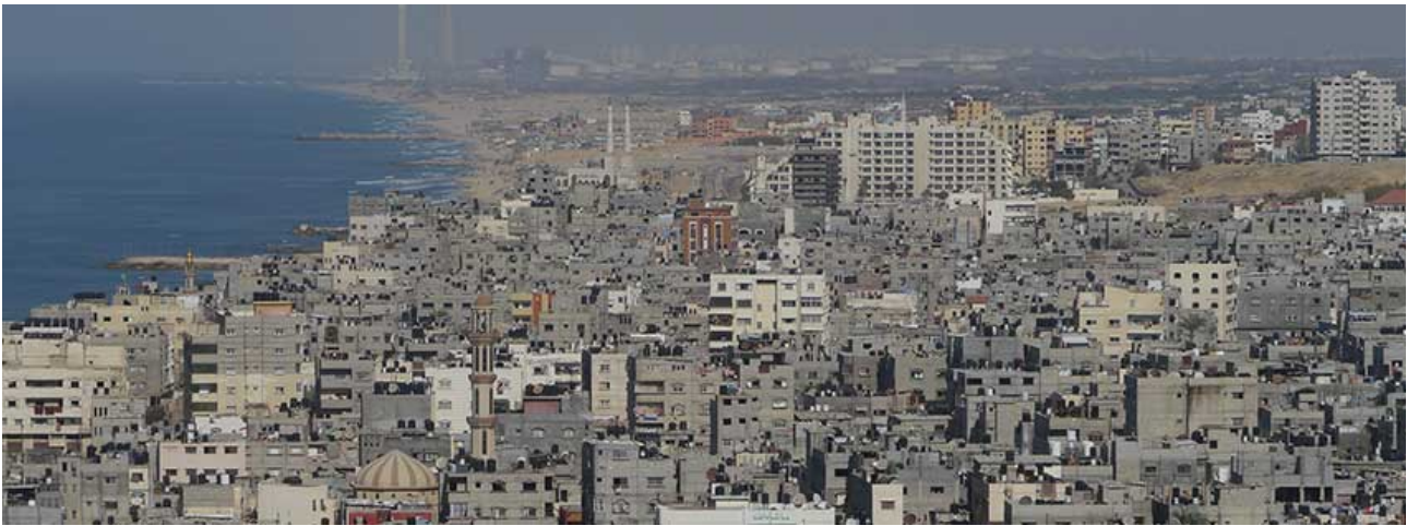
Gaza city.

Like all medical institutions in the region, Al Ahli is overwhelmed, she said adding that it is receiving many women and children who are both injured and traumatised. As of last week, people were still being pulled from the rubble of bombed buildings seriously injured, dehydrated and traumatised.