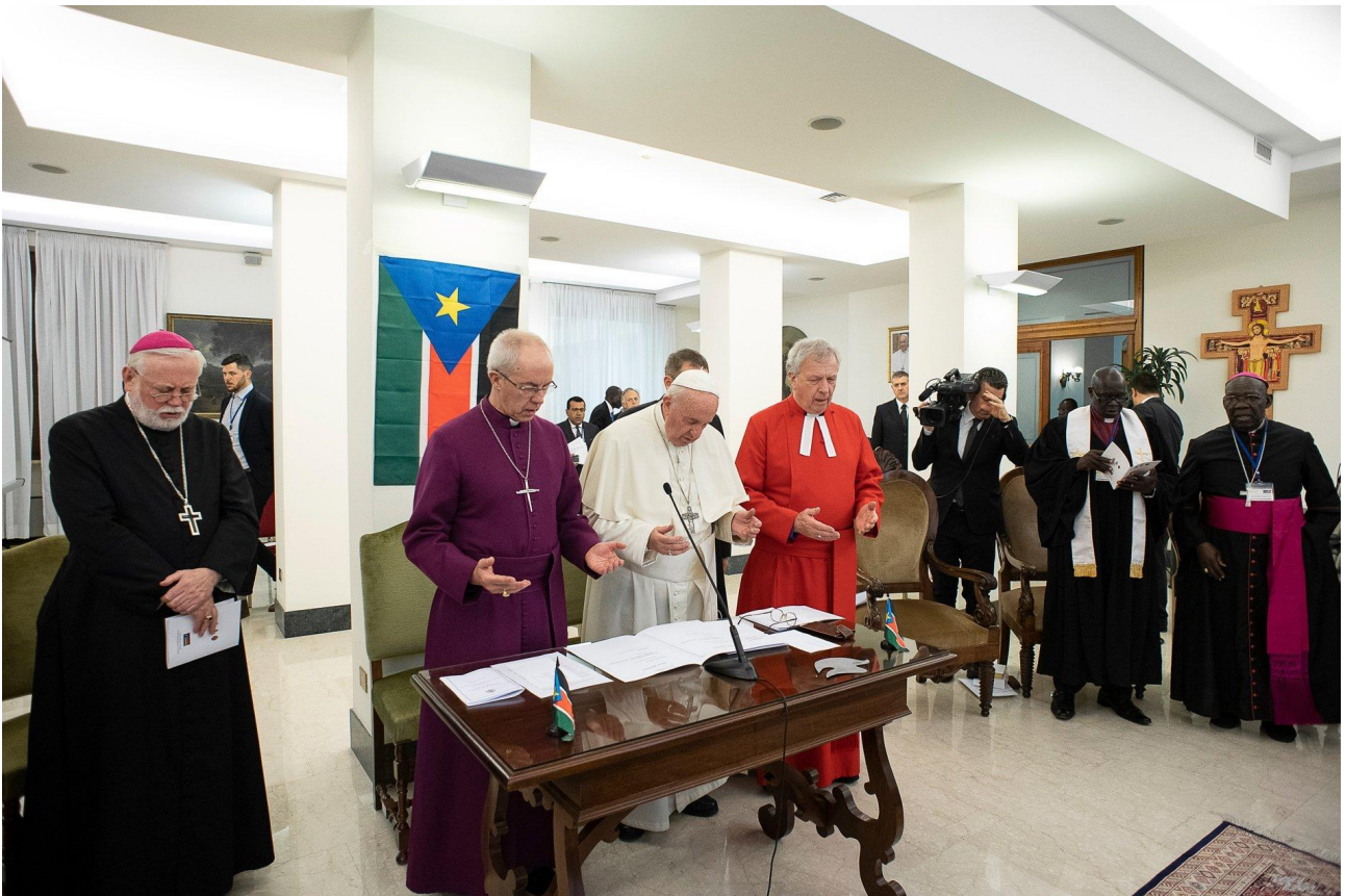
Image of the day - Pope, Anglican, and Presbyterian leaders marking South Sudan's Independence Day in 2019