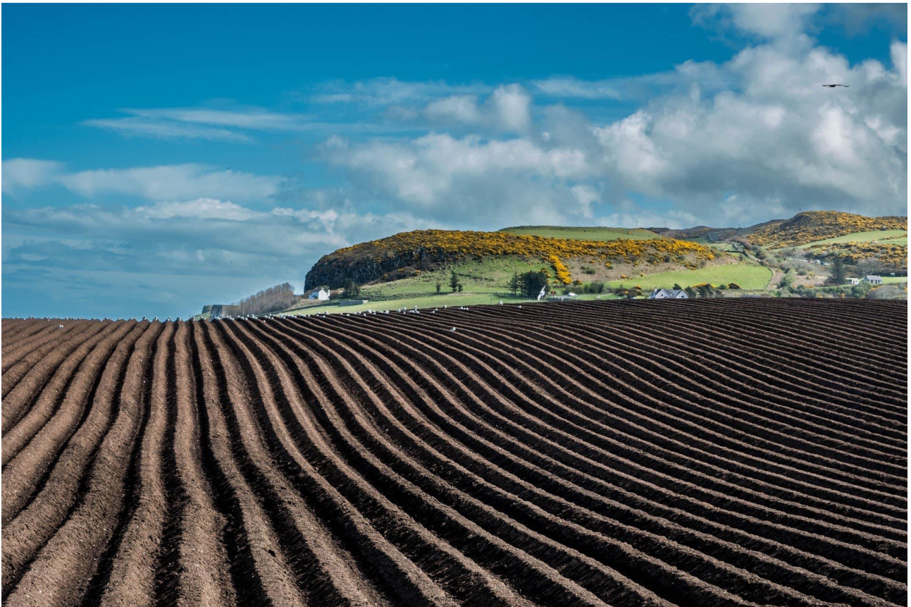
Furrows in Ballintoy, County Antrim

“Crazy as it may seem I’m trying to beat that 1982 time at the age of 60. It’ll be a very (\*very\*) tough ask but this year I’ve trained more than ever - with some 60 runs this year and clocking over 415 miles this year alone. I can’t say I’ve not put in the work: because I have and I don’t mind telling you it’s been tough at times.