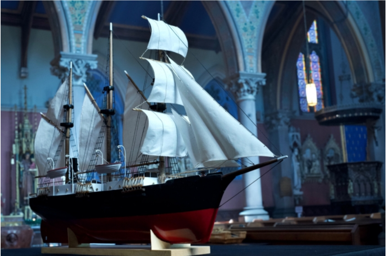
Image of the day – Brooklyn Church votive ship links covid and Endurance discovery