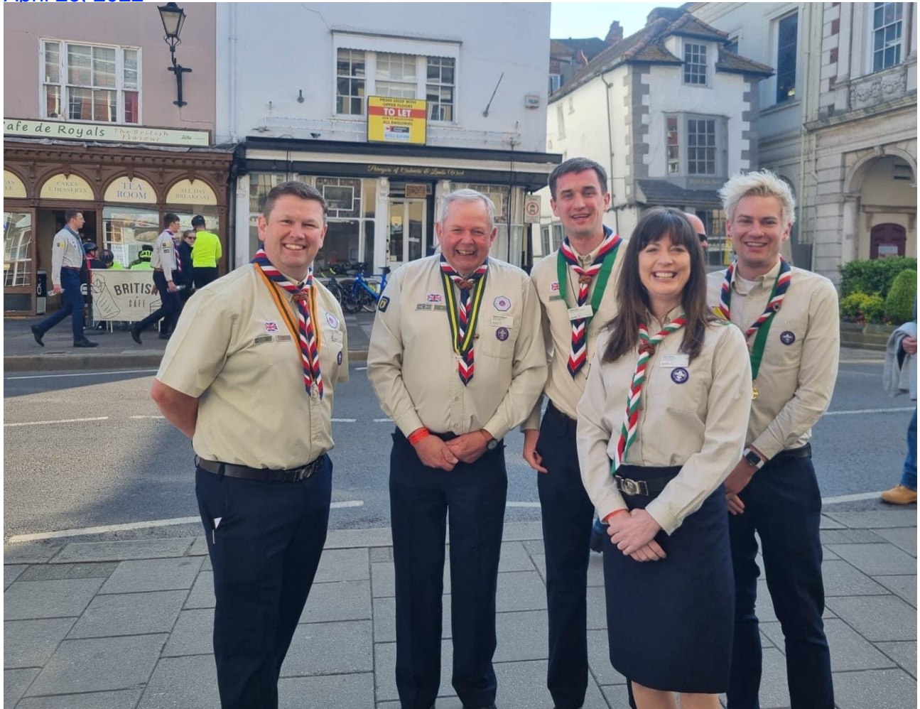
April 26, 2022

Photo above - some members of the Northern Ireland contingent at the annual Scout service at St George's Windsor