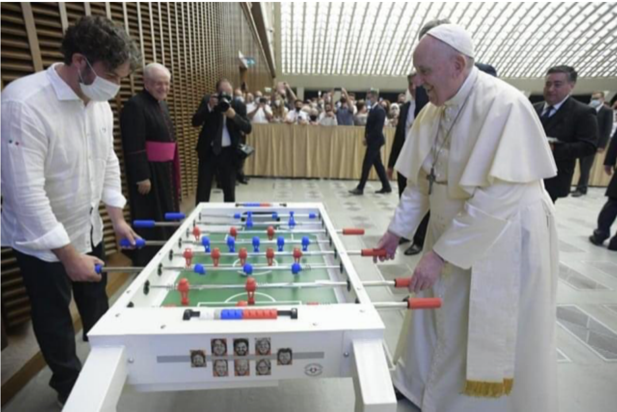
Image of the day Pope Francis on the ball