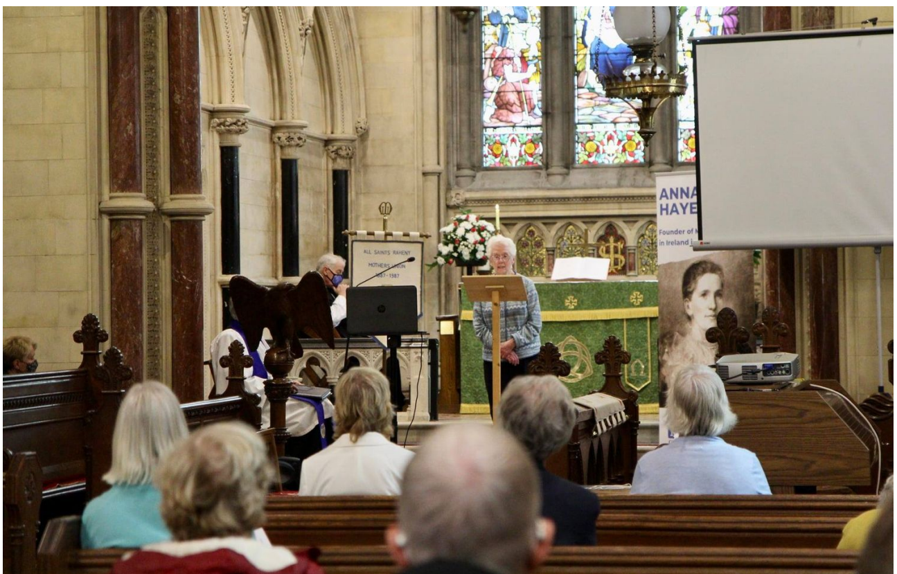
Image of the day - Centenary marked of founder of Mothers' Union in Ireland