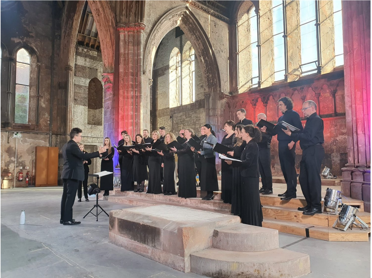
Image of the day – Voices and Brass Opening Charles Woods Festival Concert