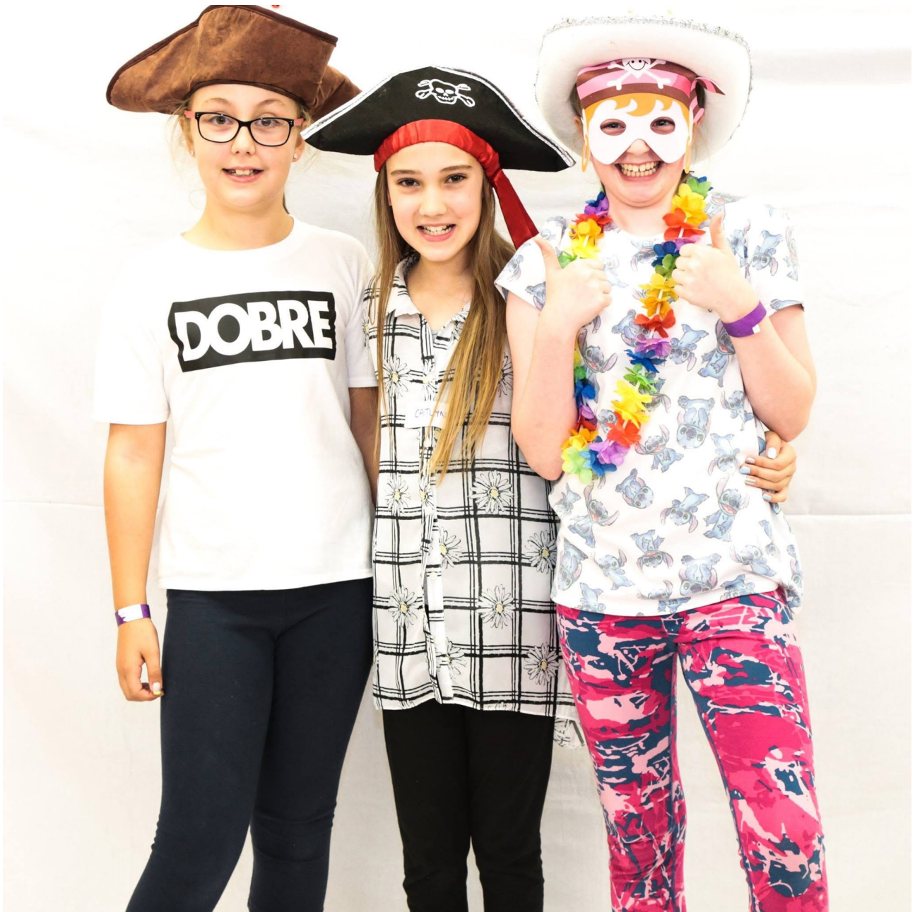
Treasure Quest week at St Paul's, Lisburn