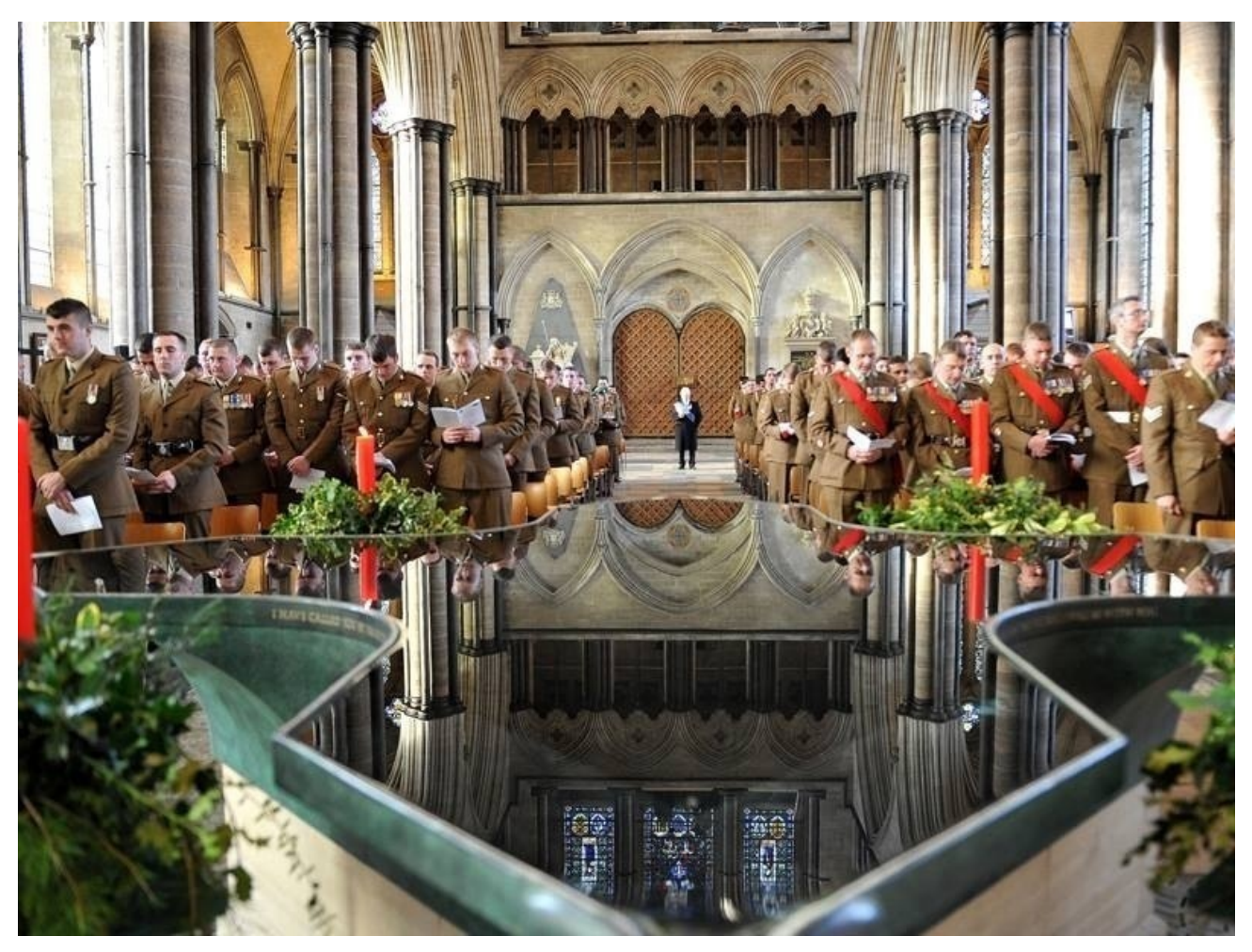
A reflective moment around the font of Salisbury Cathedral where a service was hosted to mark the return of 2 Mechanised Brigade from Afghanistan

lifestyle that is the rich inheritance of our city. We would further suggest that we need to learn to stand up to and utterly reject the threatening, violent and pernicious voices in our society who are determined, for their own self—serving reasons, to create a society which would refuse to acknowledge that a multitude of choices exist," the spokesperson said.