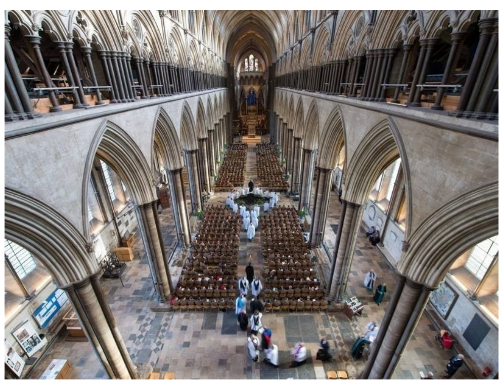
Salisbury Cathedral - choir processes around the font.

relationships and most of all for understanding and dignity."