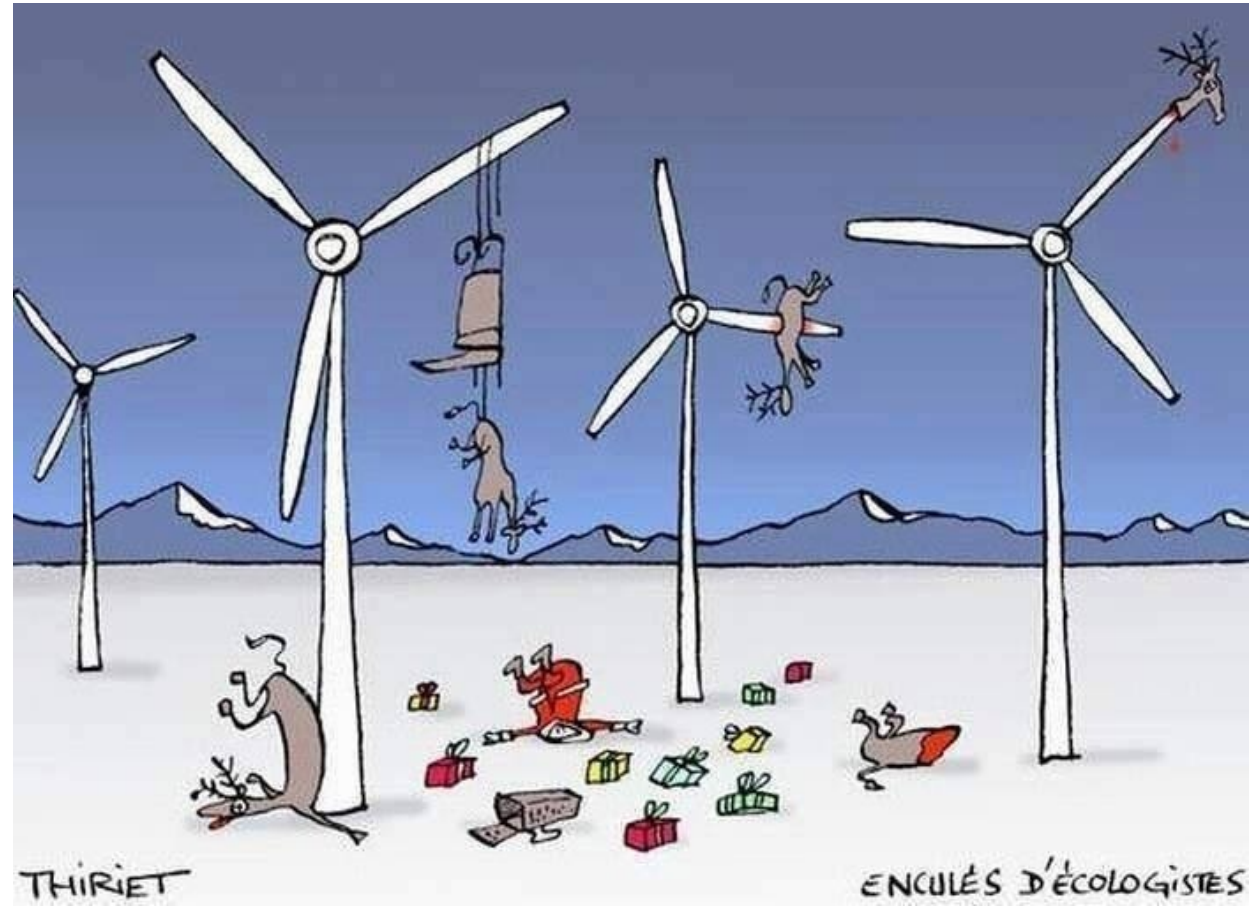
Santa and the windfarm