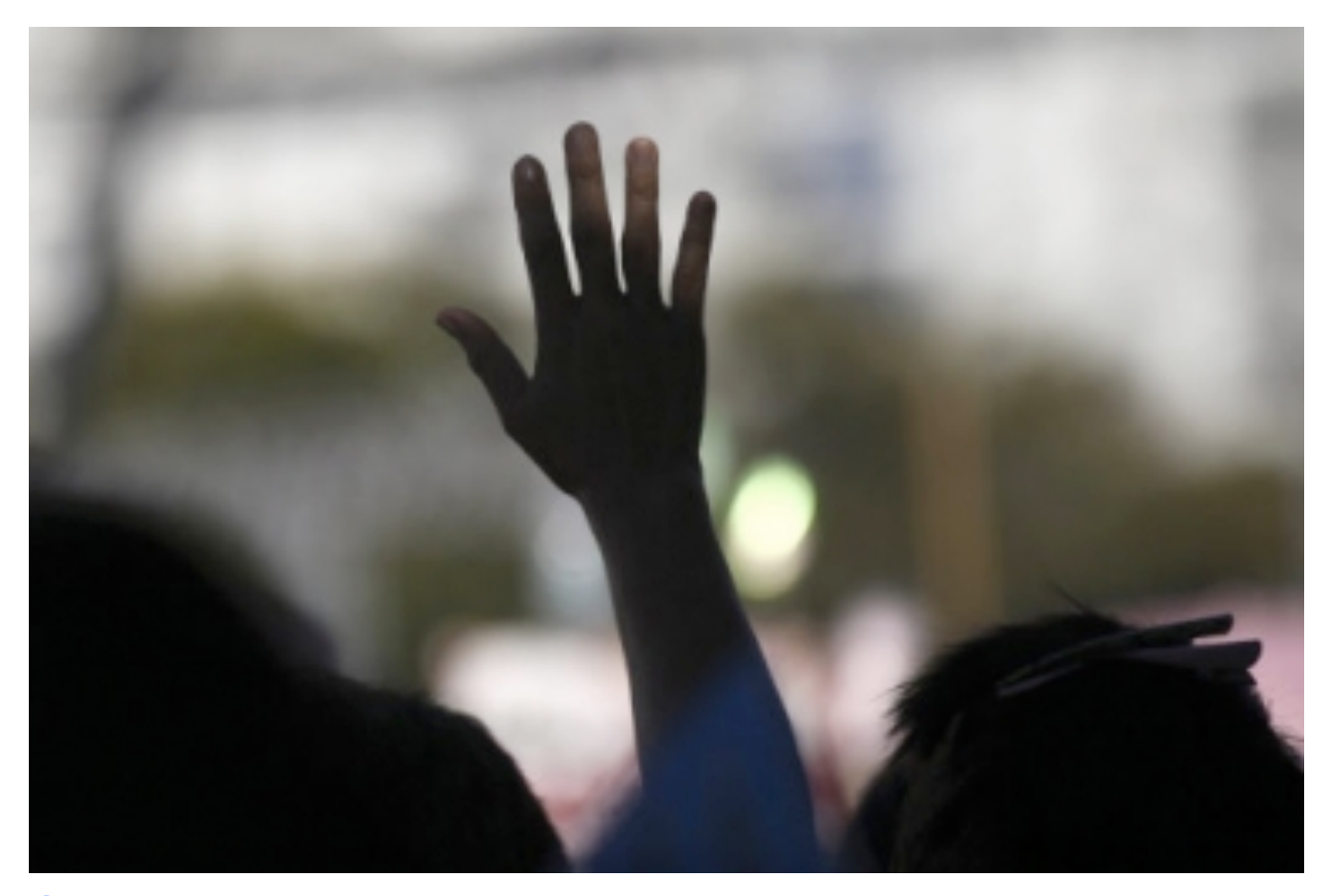
Christians encouraged to practice generosity

The President of the Methodist Church in Great Britain has issued a Christmas message in which she calls on Christians to celebrate the love of God by being generous to those around them.