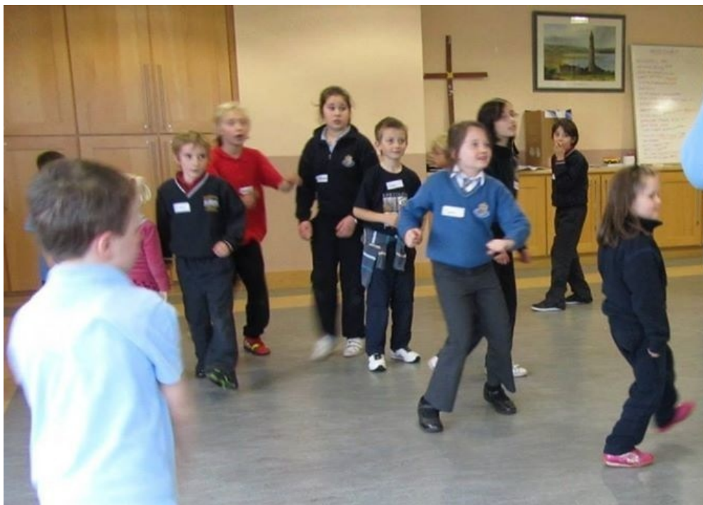
Children of Athy parish enjoy Messy Church