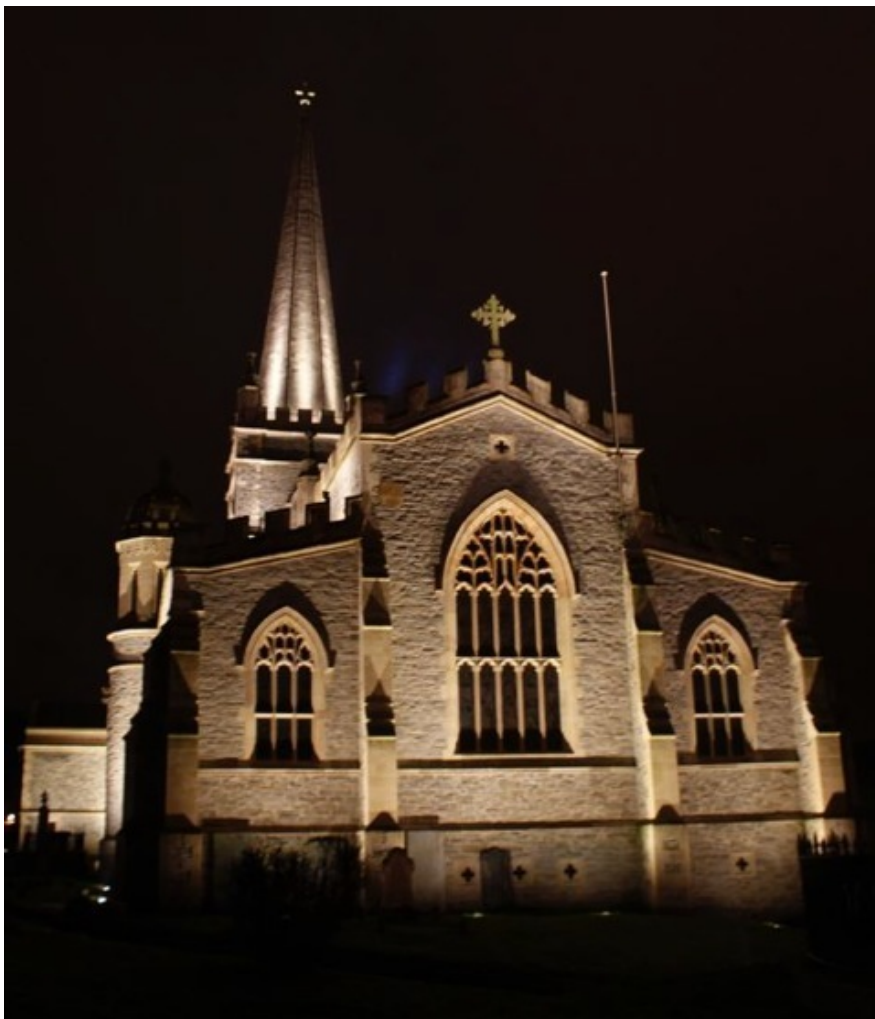
St Columb's Cathedral, Derry