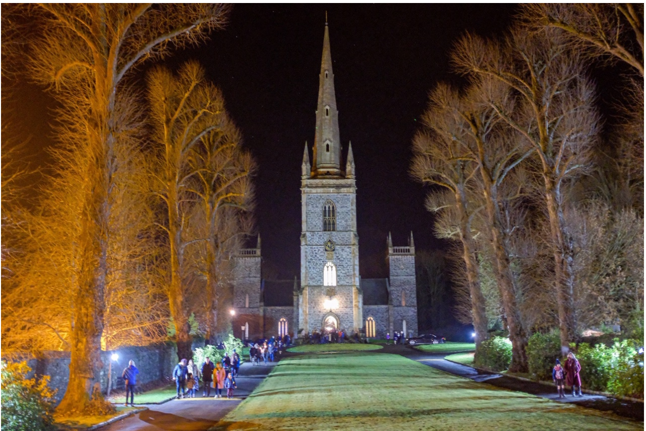
Image of the day - Advent at Hillsborough