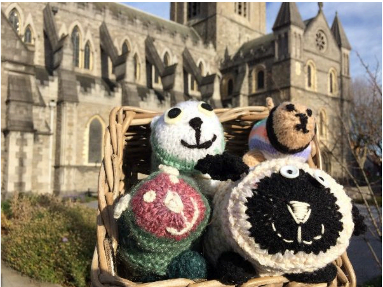
Image of the day - Upcoming outdoor Advent Sheep Trail at Christ Church Dublin