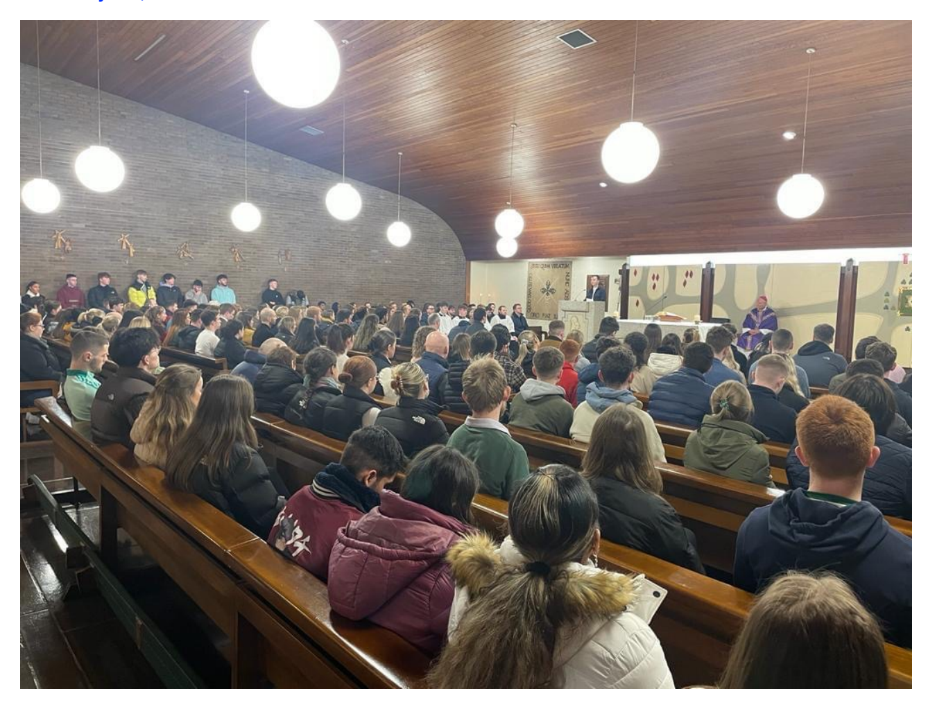
Over 1000 students on Ash Wednesday at Queen's Catholic Chaplaincy