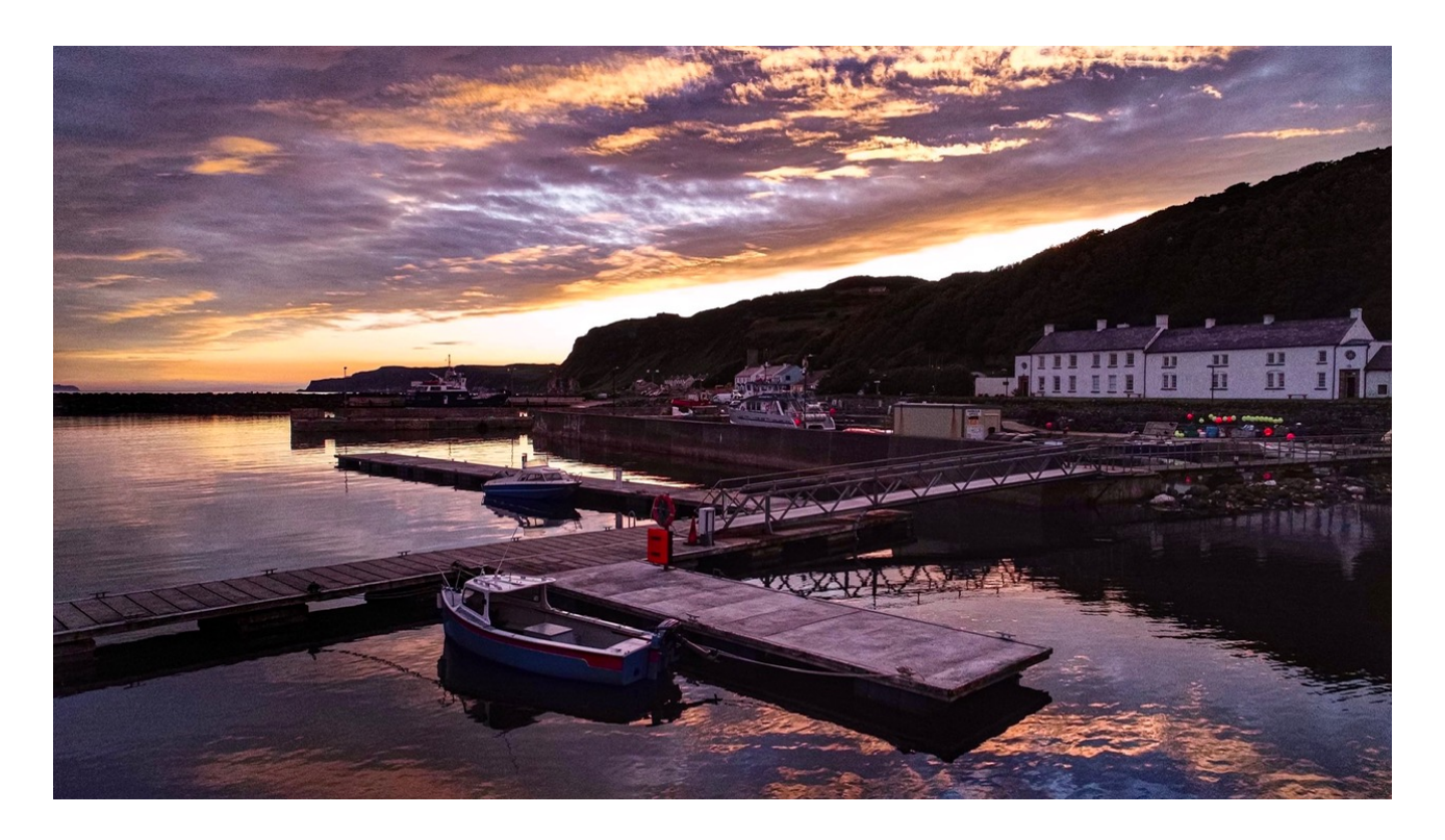
Rathlin Island sunset

Tributes were paid to all the members of the Church