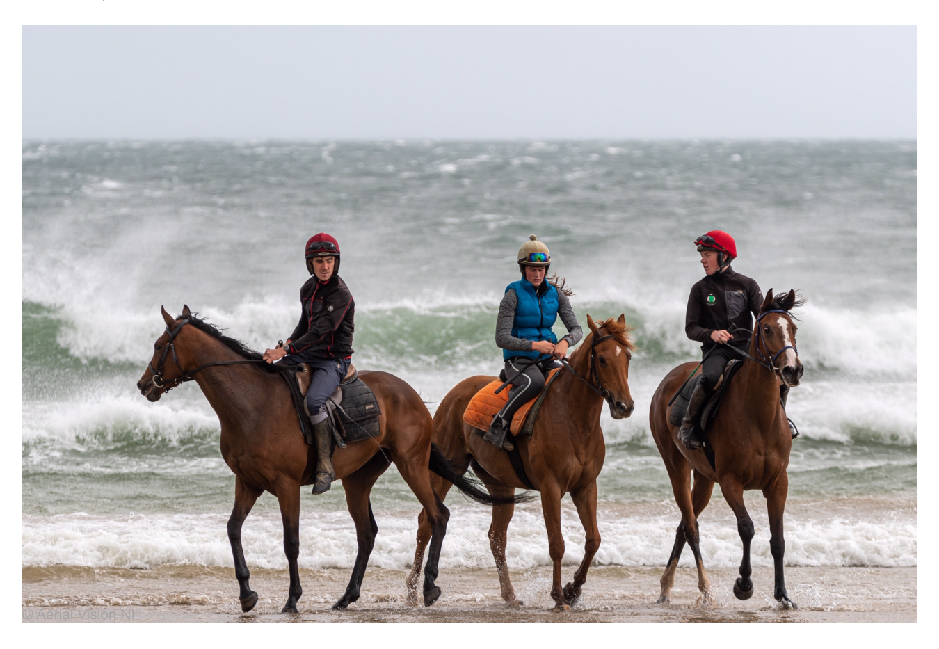
On Benone Strand, County Londonderry

"Thousands of items are already being distributed each week, and we have been overwhelmed with the increased