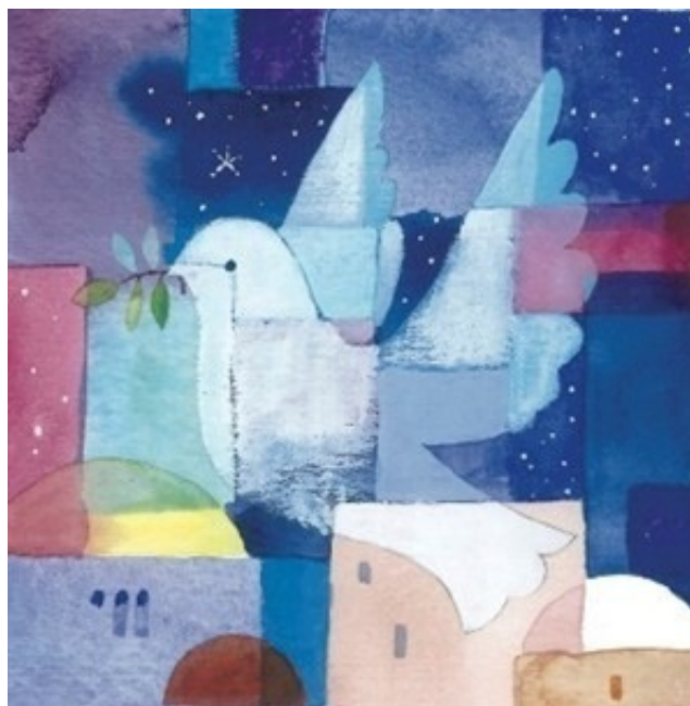
Corrymeela now have a range of Christmas cards on sale - details in this issue