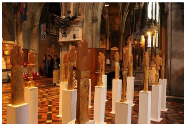
Statues currently on display in St Patrick's Cathedral, Dublin.