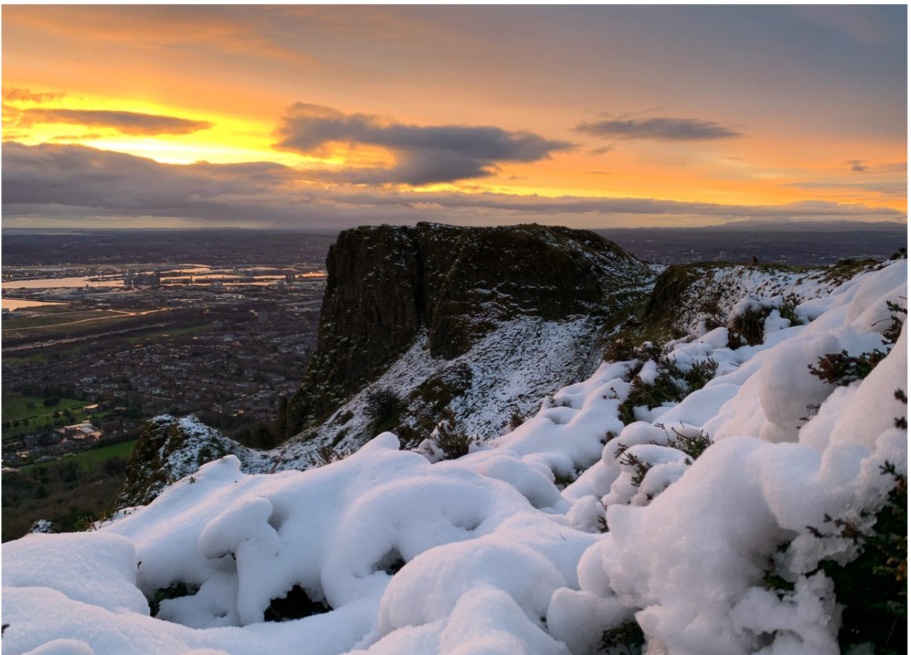
The Cavehill, Belfast

“The tribunal reported in December 2013, but to date no further action has been taken,” the DUP leader said.