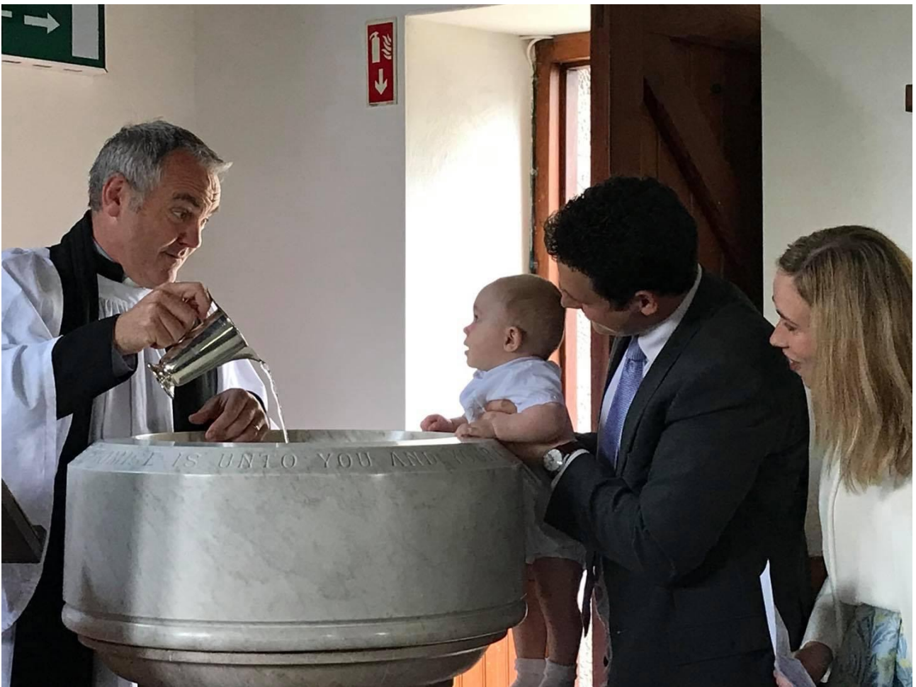
Image of the day Baptism at Drumbo Captions invited