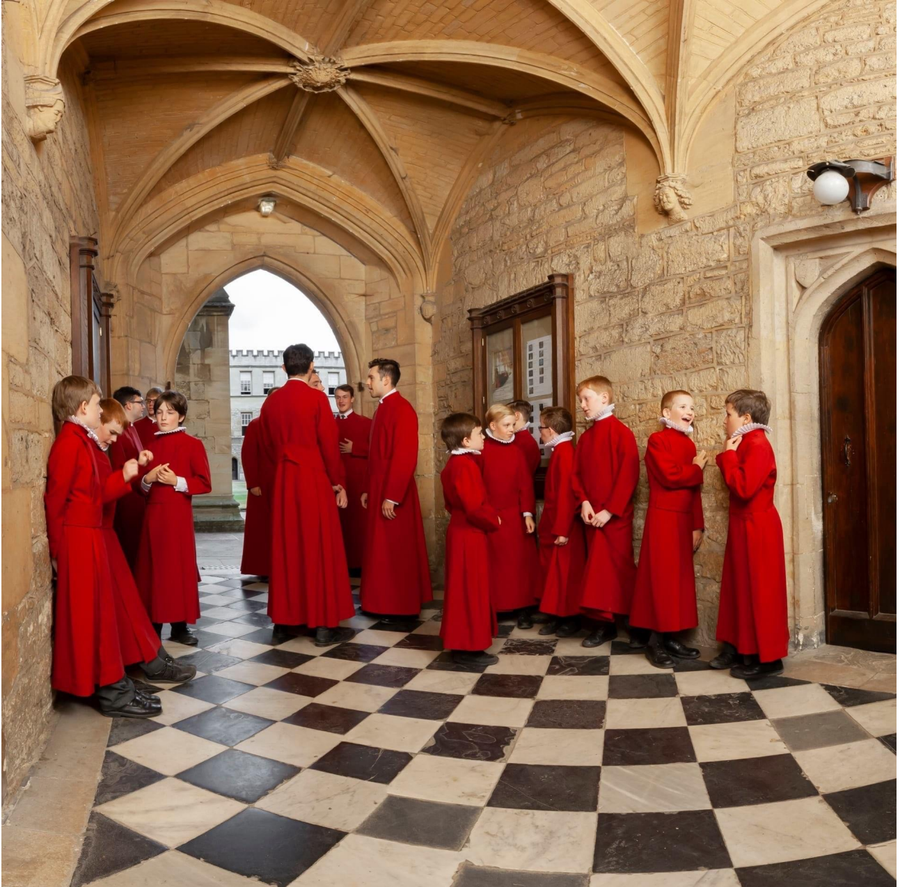
Image of the day – Oxford College choir to visit The Cathedral on the Hill