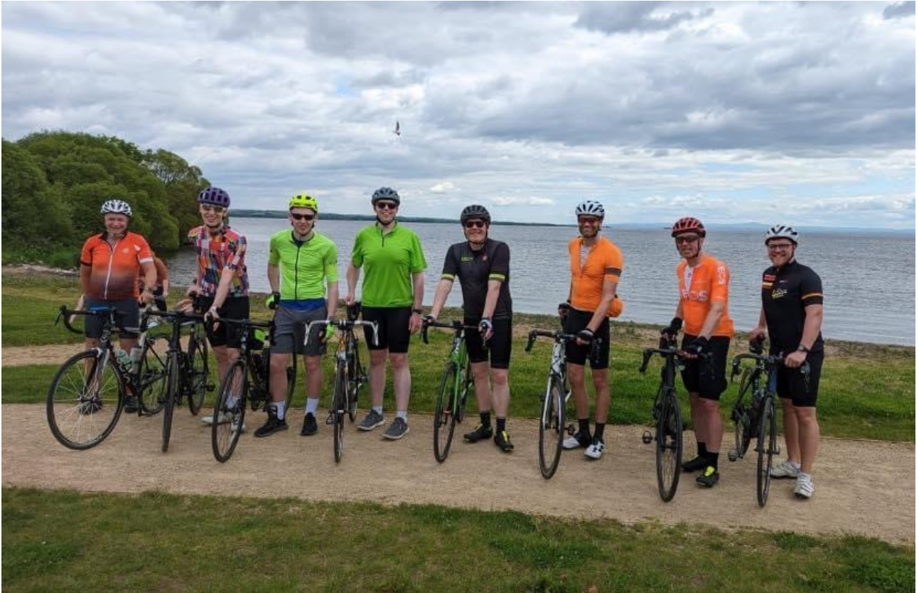
Team photo at Ballyronan Marina

Members of the Hub Chaplaincy at Queen's University, Belfast, have been fundraising for for Waakisa Ministries Trust NI and Abaana.