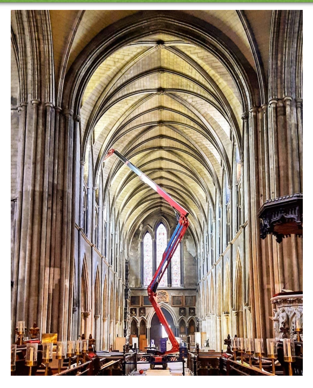
Image of the day - St Patrick's Cathedral Dublin, Celestory windows restored