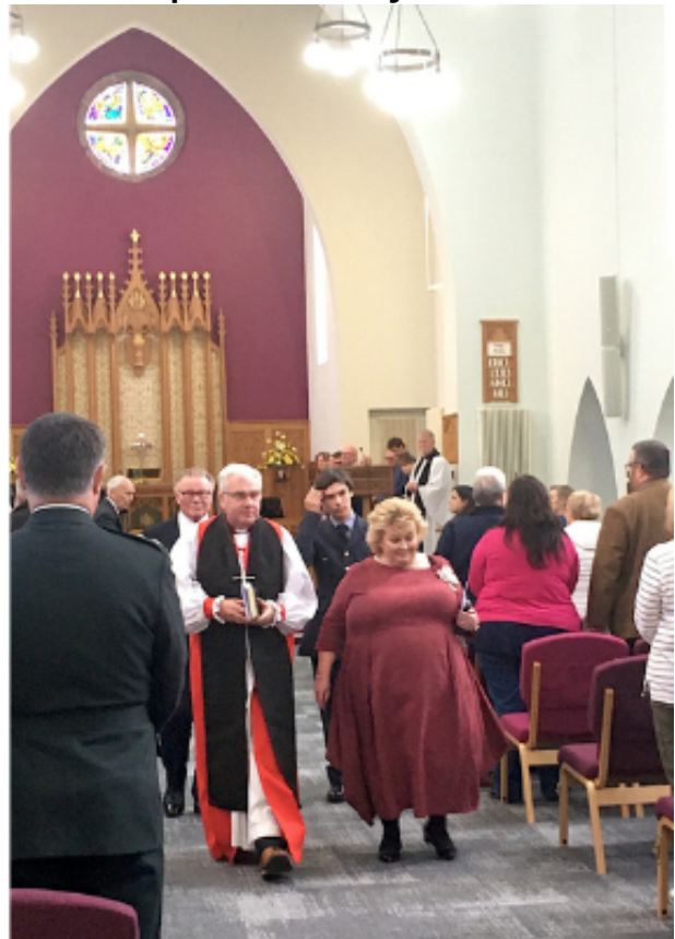
Refreshments on the lawn. The Bishop escorts HM Lord Lieutenant of Belfast