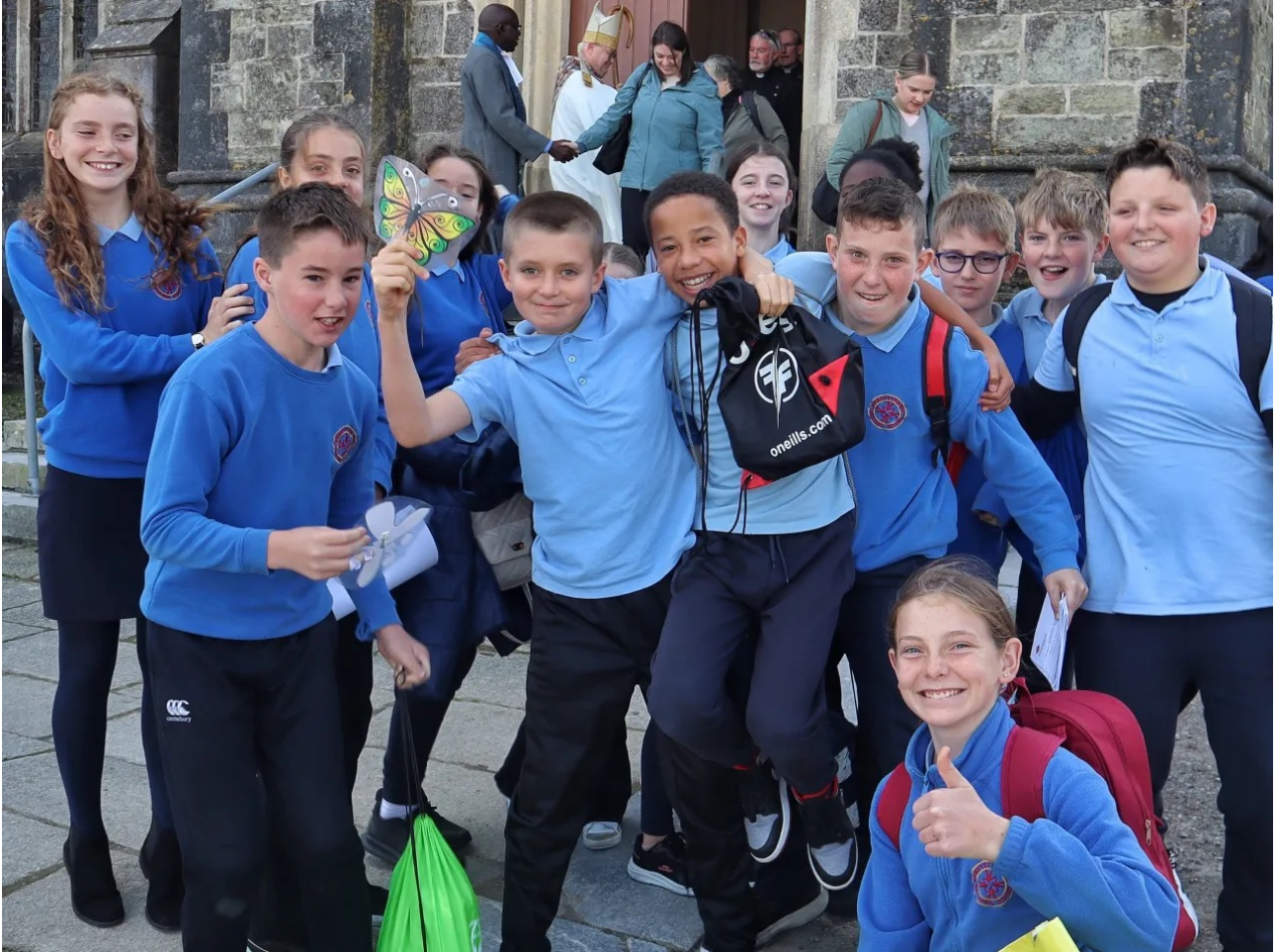
Children after the annual Diocesan Schools Service at St Peter's Church, Bandon

parishes in the Diocese to reflect on their outreach, inclusion and engagement of children and families.