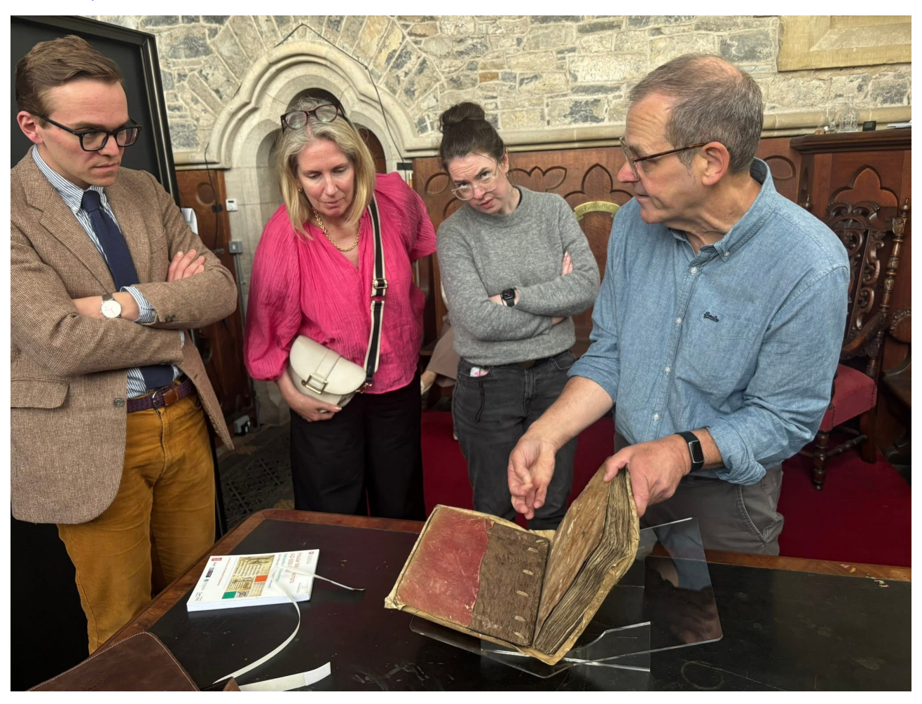
Hood of the RCB Library visited Saint Canice's Cathedral for the final page turn on the Red Book of Ossory.

They were accompanied by library staff and members of the RCB Property and Trusts Department. The final stage of the exhibit shows off the fabulous red binding that gives the book its name.