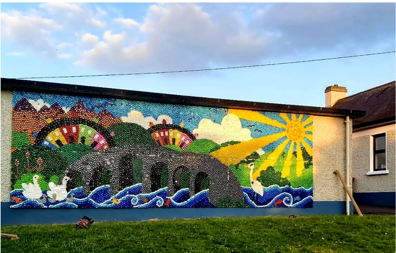
Image of the day - Lockdown mural from 12K+ bottle tops by Ballymoney school Cork