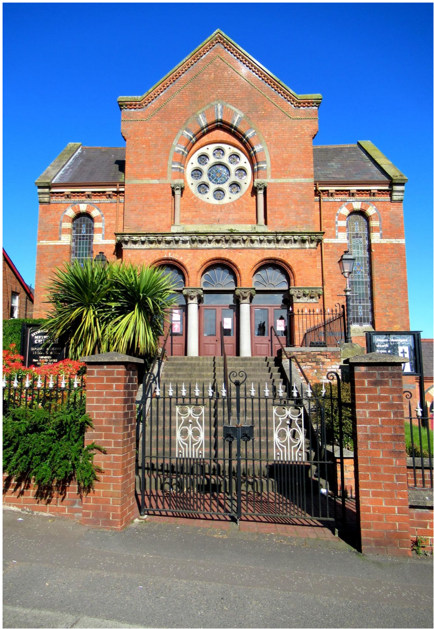
Image of the day - Seymour Street Methodist Church, Lisburn