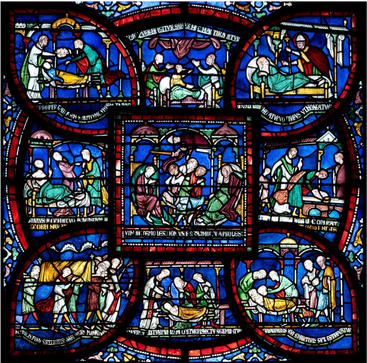
Image of the day - The miracles window, Canterbury